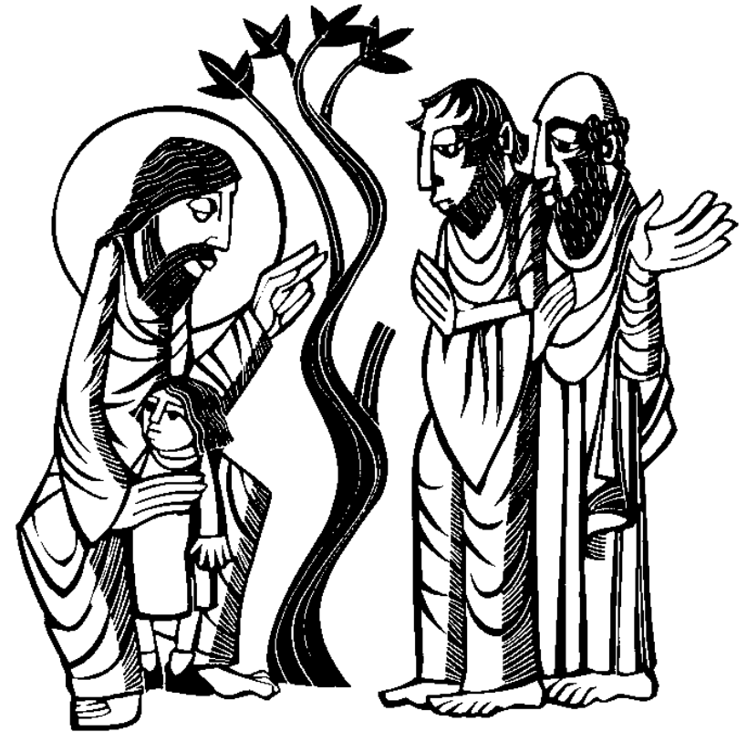
Jesus with a child

A wheelchair, walker and baby changing facilities are available: please ask.