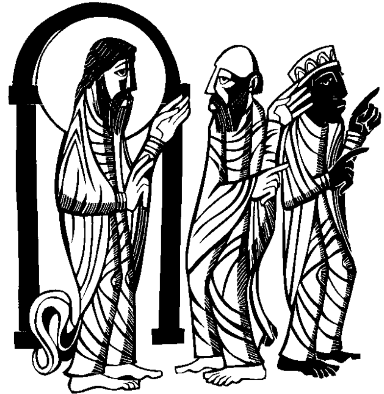
Jesus and disciples

A wheelchair, walker and baby changing facilities are available: please ask.