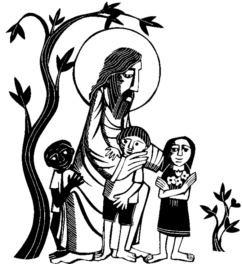
Jesus with children.

A wheelchair, walker and baby changing facilities are available: please ask.