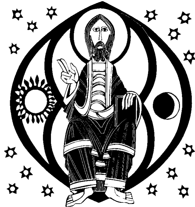
Jesus with sun, moon and stars.

A wheelchair, walker and baby changing facilities are available: please ask.