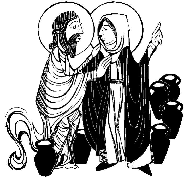
Jesus with Mary at the Wedding in Cana

A wheelchair, walker and baby changing facilities are available: please ask.