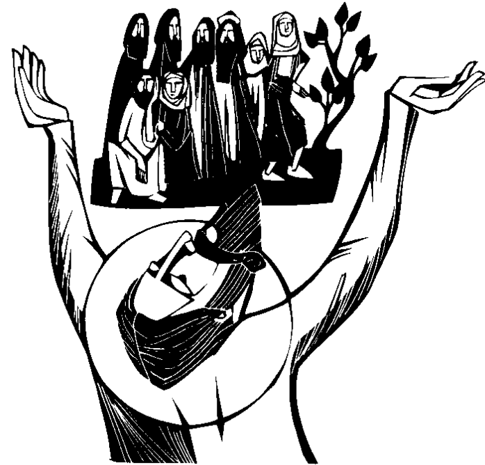
Jesus preaching to the multitudes

Please take this Pew Sheet home with you and pass it on to others. Large Print version available—please ask.